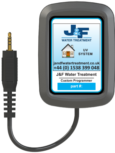
Custom Programming Module