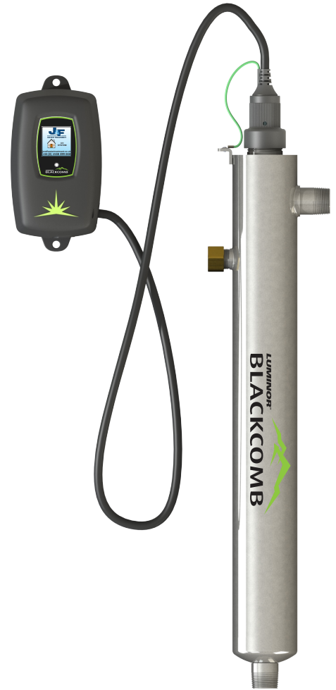
UV System Render